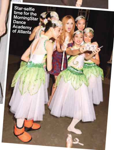
Star-selfie time for the MorningStar Dance Academy of Atlanta