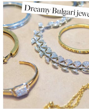
Dreamy Bulgari jewels

From top: TUNG WALSH (3); NICOLAS BLOISE (4); Details, see teenvogue.com